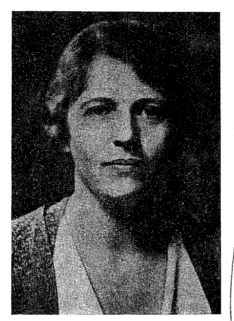
PEARL S. BUCK

"I have not read merely a report. I have read a unique book, a great book. The book presents a masterly statement of religion in its place in life, and of Christianity in its place in religion. The first three chapters are the finest exposition of religion. I have ever read. The later chapters present a true and perfect picture of missions, and last of all are a series of