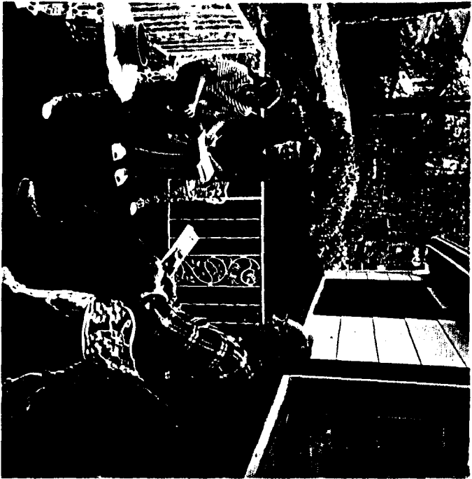
duplicate GFC with daughter Lois and granddaughter Lydia at Lookout Mountain